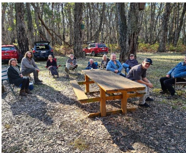
Some of us relaxing in the bush after the AGM.