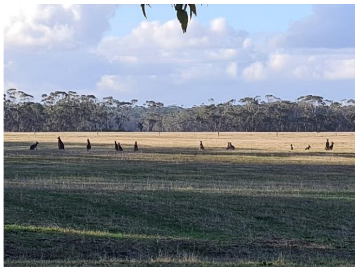
Some of our resident grey kangaroos eating out – on our neighbour's grass!