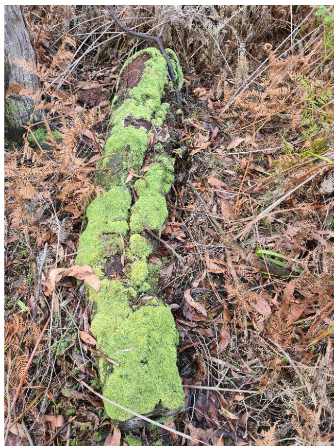
Moss still looks lush despite our dry conditions